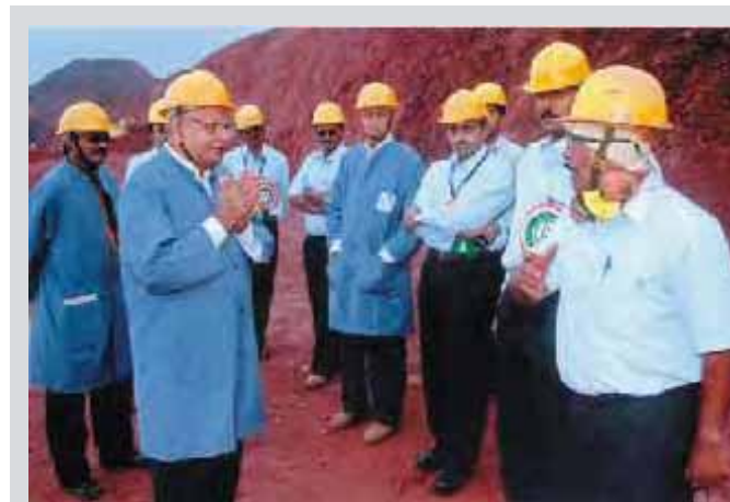
Inspection team interacting with the mining team

At the state level, 20 different trade tests were conducted, involving both - underground and open cast mines. The competition attracted over 200 participants and 52 of them won cash prizes.