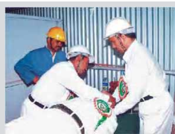
The VIOM team performing the First-Aid Trade Test

The prizes won by the members of the Baldota Group in the Safety Week at both Zonal and State Levels are as follows: